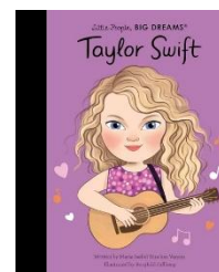
Taylor Swift, Little People, Big Dreams Sanchez Vegara