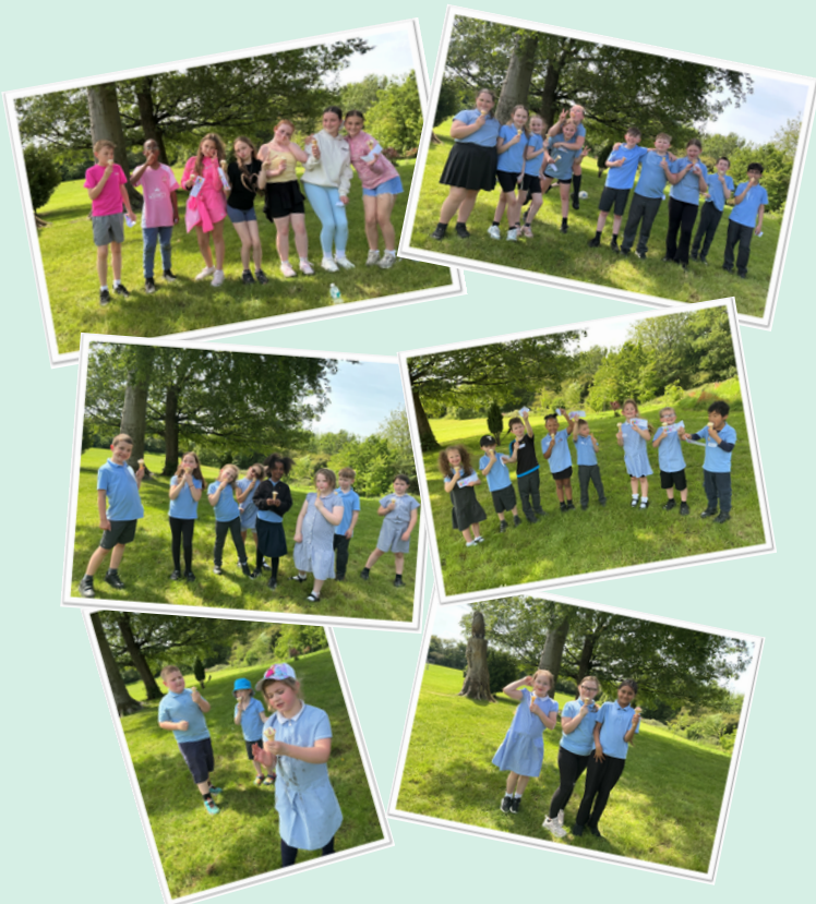
Headteachers Picnic - 100%

It's Cool to be in School This term's winners of the Awesome Attendance Trophy is 2SK!